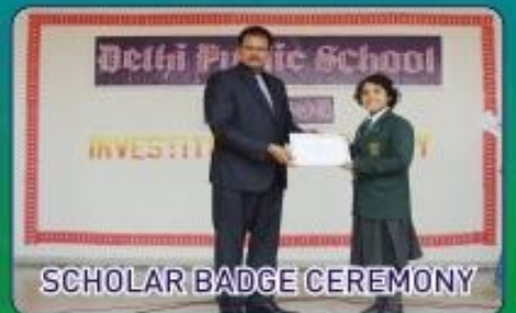
SCHOLAR BADGE CEREMONY