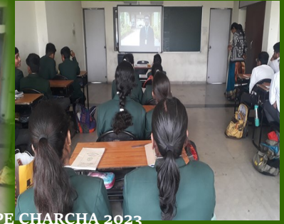
PARIKSHA PE CHARCHA 2023